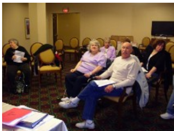
Attendees at 2011 Annual Meeting