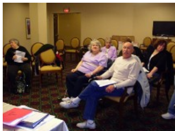
Attendees at 2011 Annual Meeting