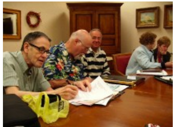
Am Chai Board At Work