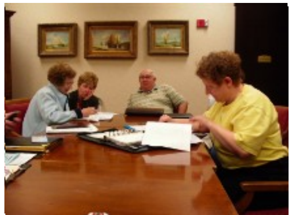
Am Chai Board At Work