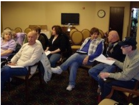
Attendees at 2011 Annual Meeting

If you would like to honor someone, a great way to do so is to buy an Am Chai prayer book in his or her honor. For a donation of $30.00 we will put your name inside the front cover along with anyone's name that you want to honor. For further info, call (847) 604-4060 or email info@amchai.org.